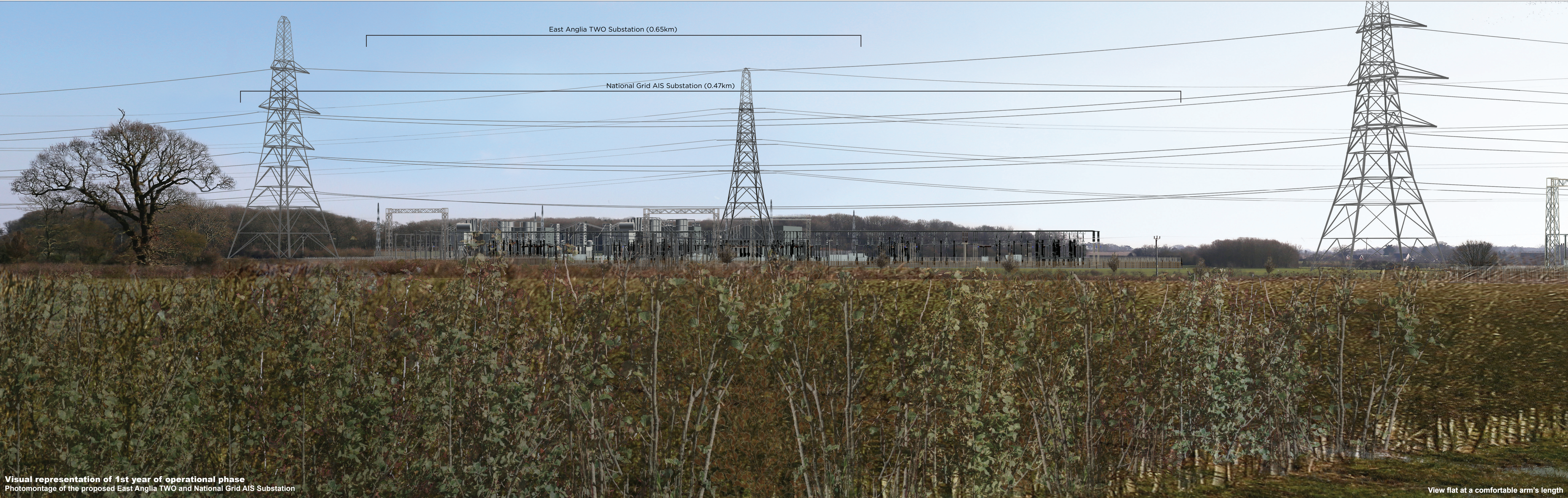
Visual representation of 1st year of operational phase Photomontage of the proposed East Anglia TWO and National Grid AIS Substation