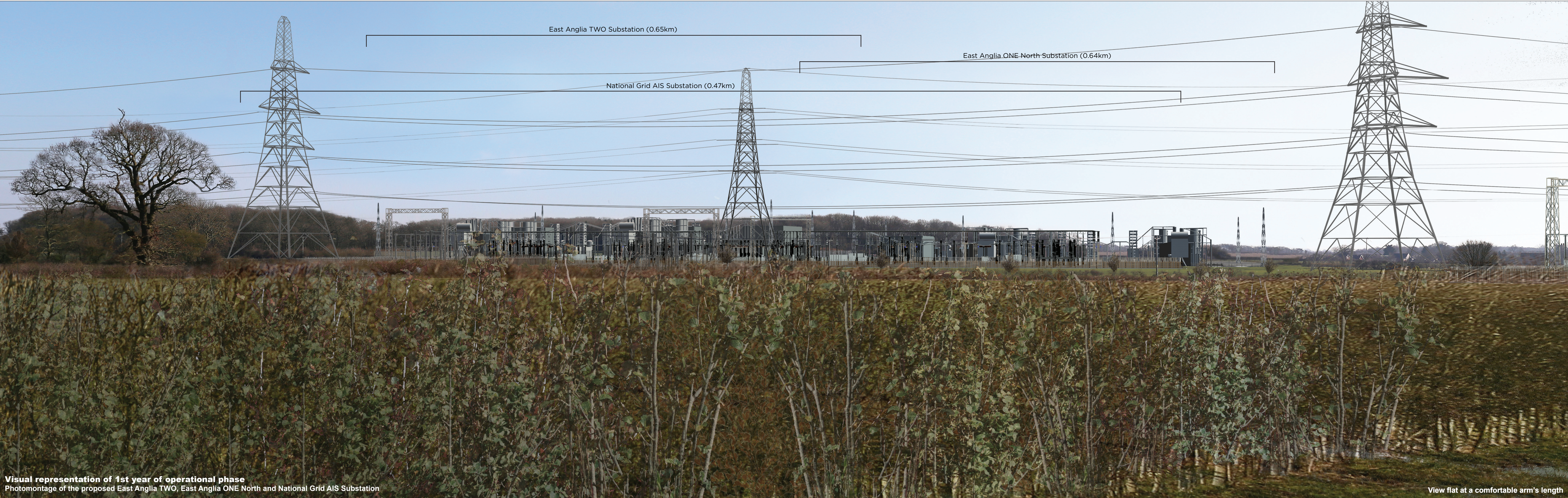
Visual representation of 1st year of operational phase Photomontage of the proposed East Anglia TWO, East Anglia ONE North and National Grid AIS Substation